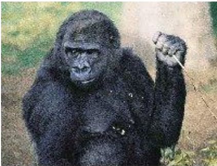
Western Lowland Gorilla (female)

Source:Turnbaugh, et al. (2002), p. 141, et passim